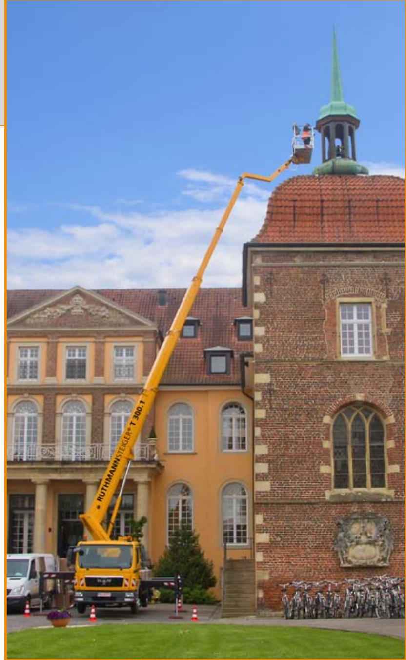
For further information visit: www.ruthmann.de/t300_1en