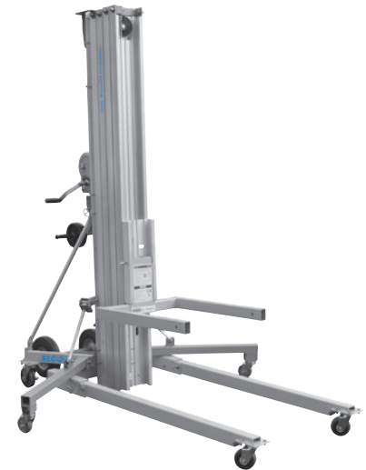
(1) Available aftermarket only