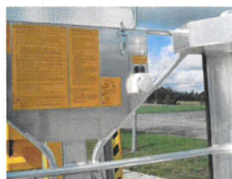
230 V outlet in basket