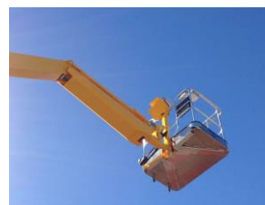
Flush basket mount