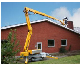
Up and over